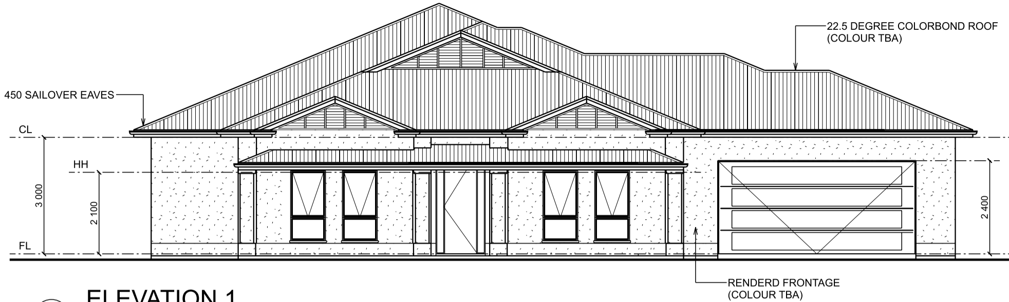
E1 ELEVATION 1 SCALE 1:100 @ A3