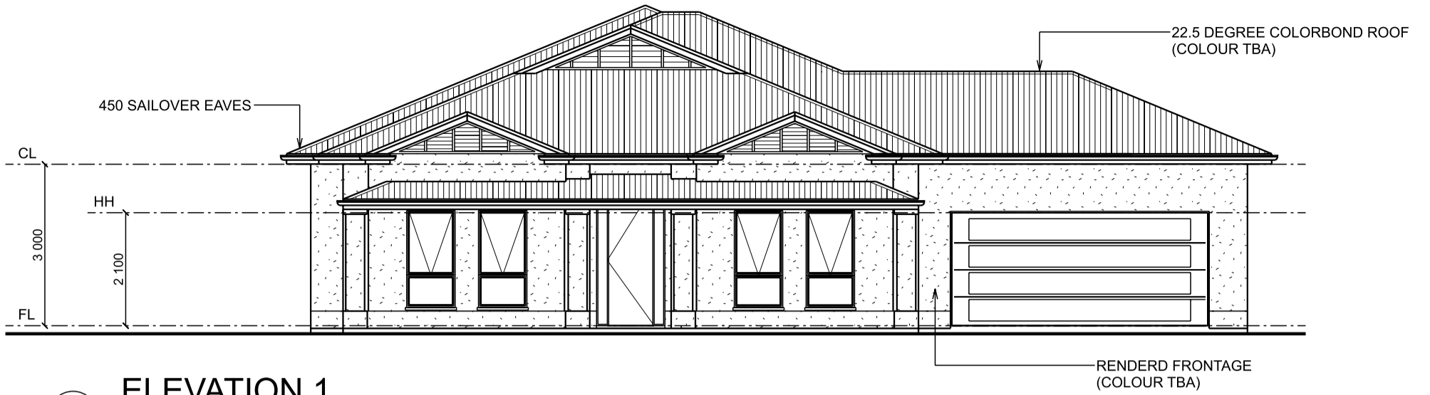
E1 ELEVATION 1 SCALE 1:100 @ A3