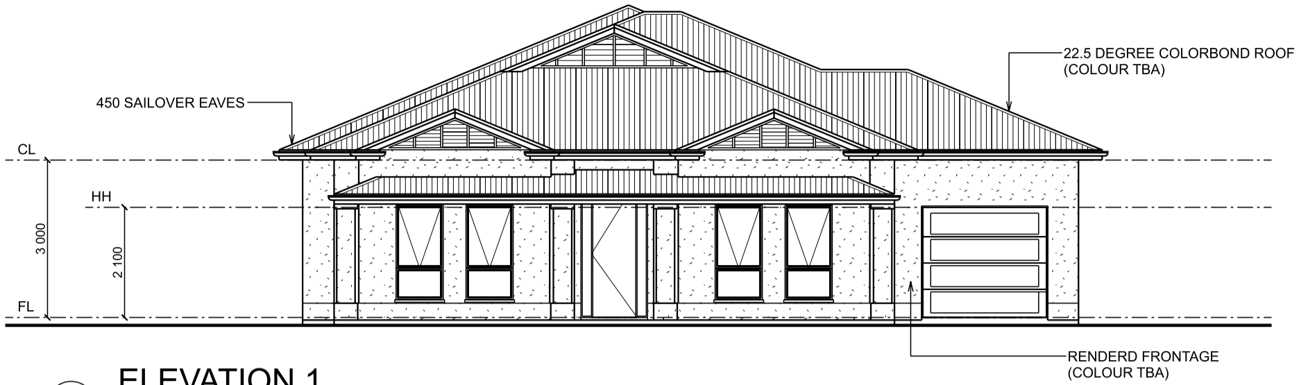
E1 ELEVATION 1 SCALE 1:100 @ A3