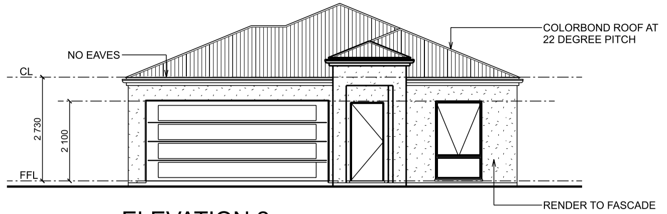
E2 ELEVATION 2 SCALE 1:100 @ A3